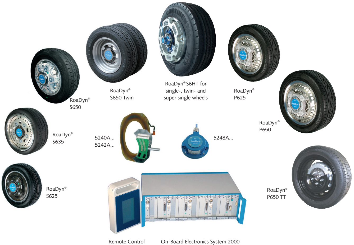
Fig 1: Compatibility RoaDyn® System 2000