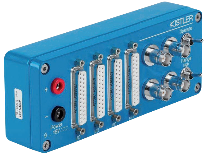
Fig. 1: Control Box Type 5693

The main focus is on dynamic stability and traction control, ABS systems, the investigation of fading effects, braking jitter, performance measurements, the measurement of friction and coasting behavior. Further applications are the development of transmission systems, chassis control systems as well as the preparation of government safety tests such as, for example, the U.S.-procedure FMVSS 135.